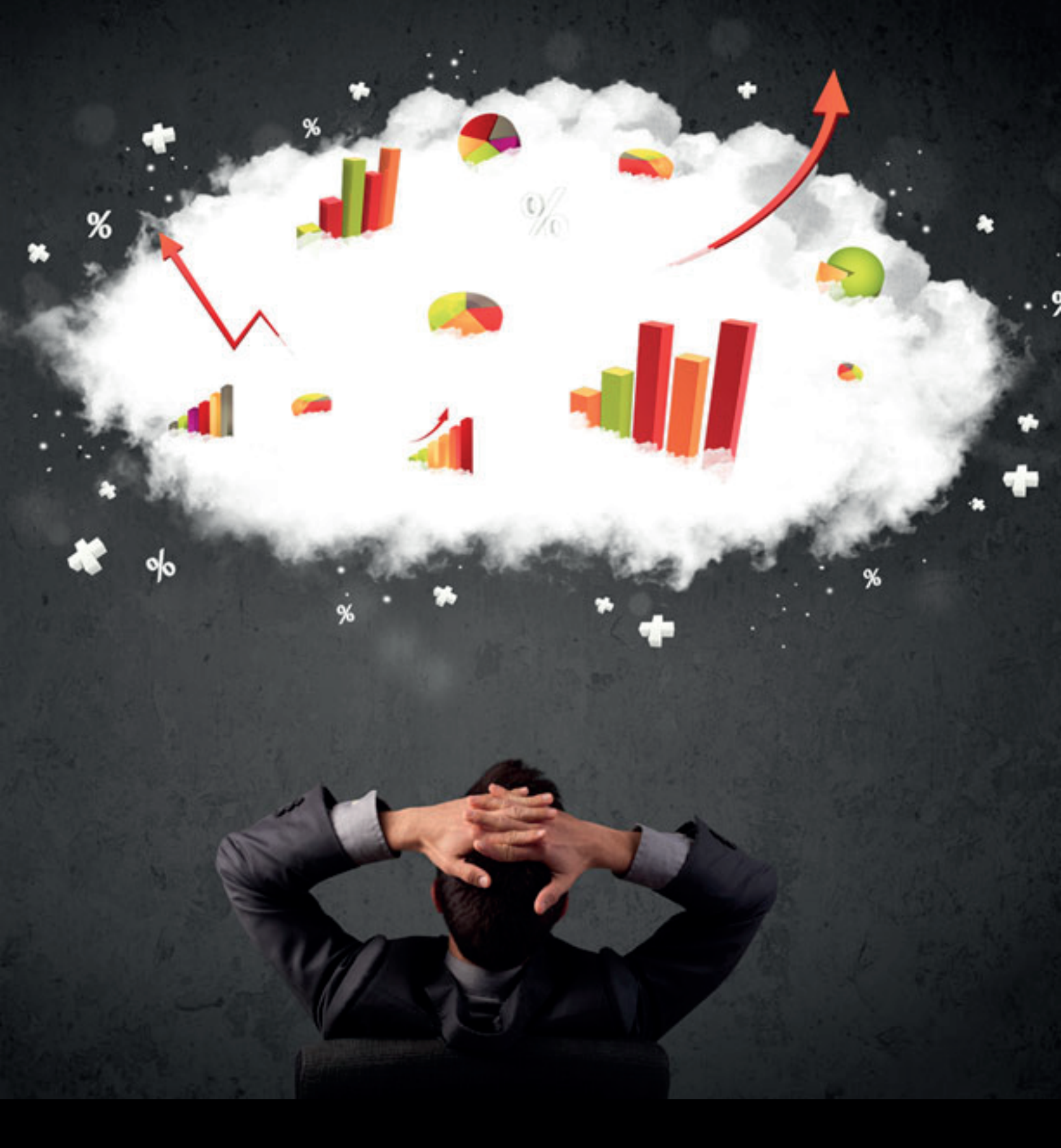
Site24x7: Powerful, Agile, Cost-Effective IT Management from the Cloud

Ensuring Optimal Performance and Quality Web Experiences