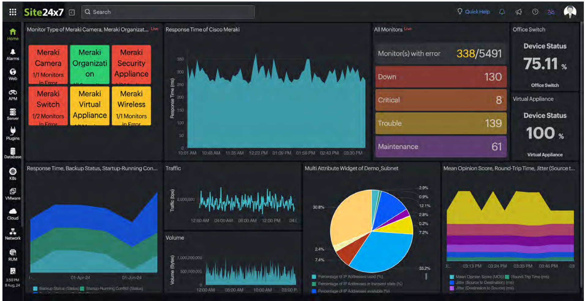
Figure 1. Track relevant metrics on a single dashboard.